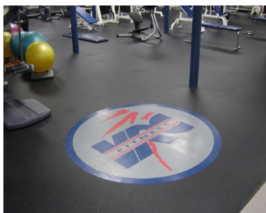
Custom logo cutting available